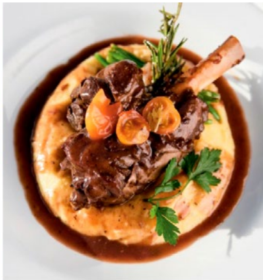
Lamb Shanks Braised in Red Wine with Soft Lavender Polenta and Bacon-wrapped Green Beans Serves 6